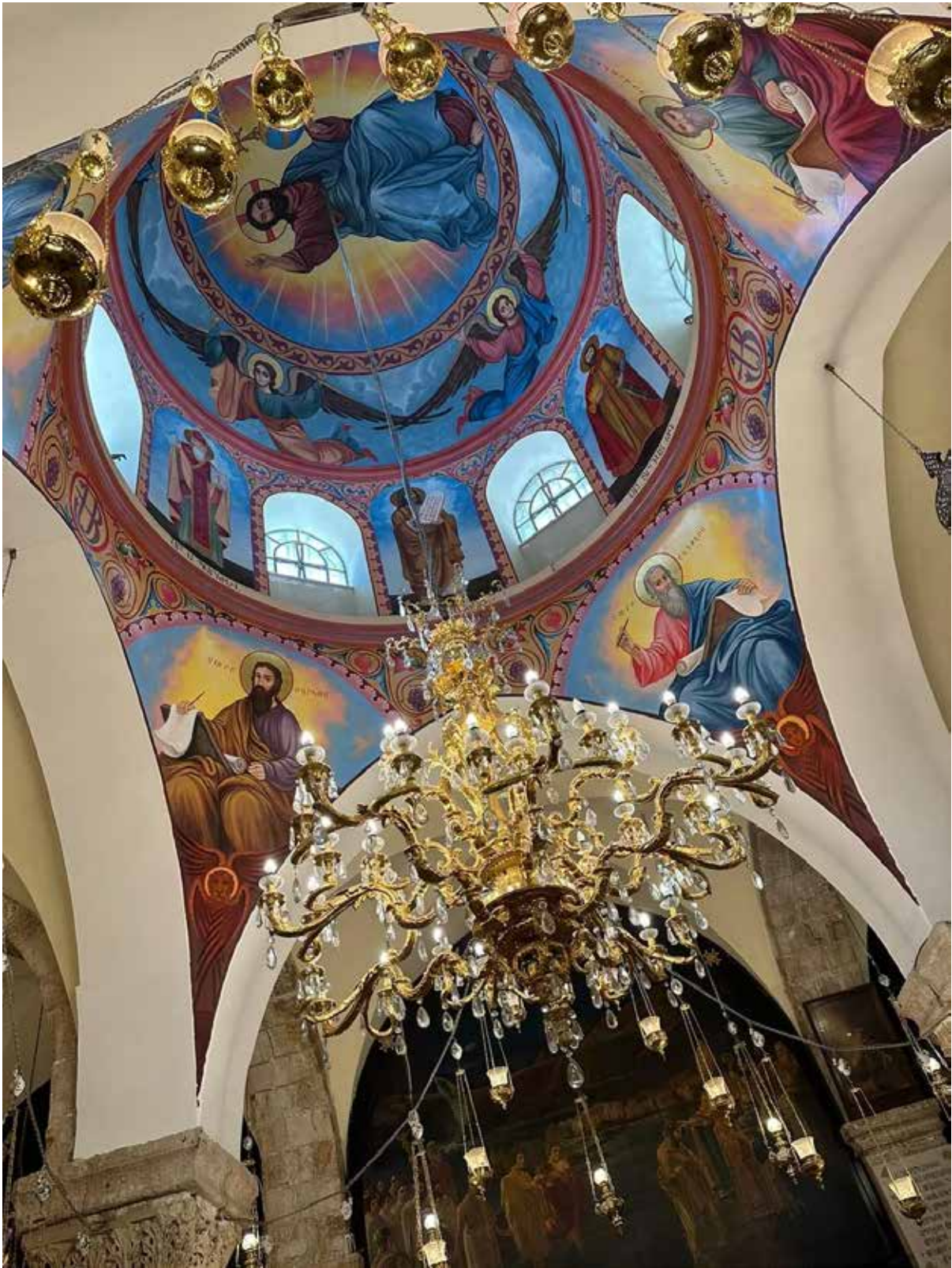
The Church of the Holy Sepulchre contains the site where Jesus was crucified, and the tomb where he was buried and resurrected.