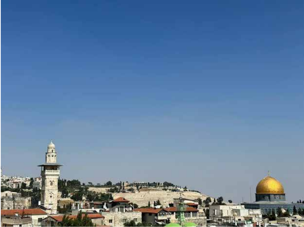
The Mount of Olives and the Temple Mount.

While NTIA was making its announcement, I was in Israel. Because many of you have been witness to my personal and professional journey, I am sharing a few photos from my trip.