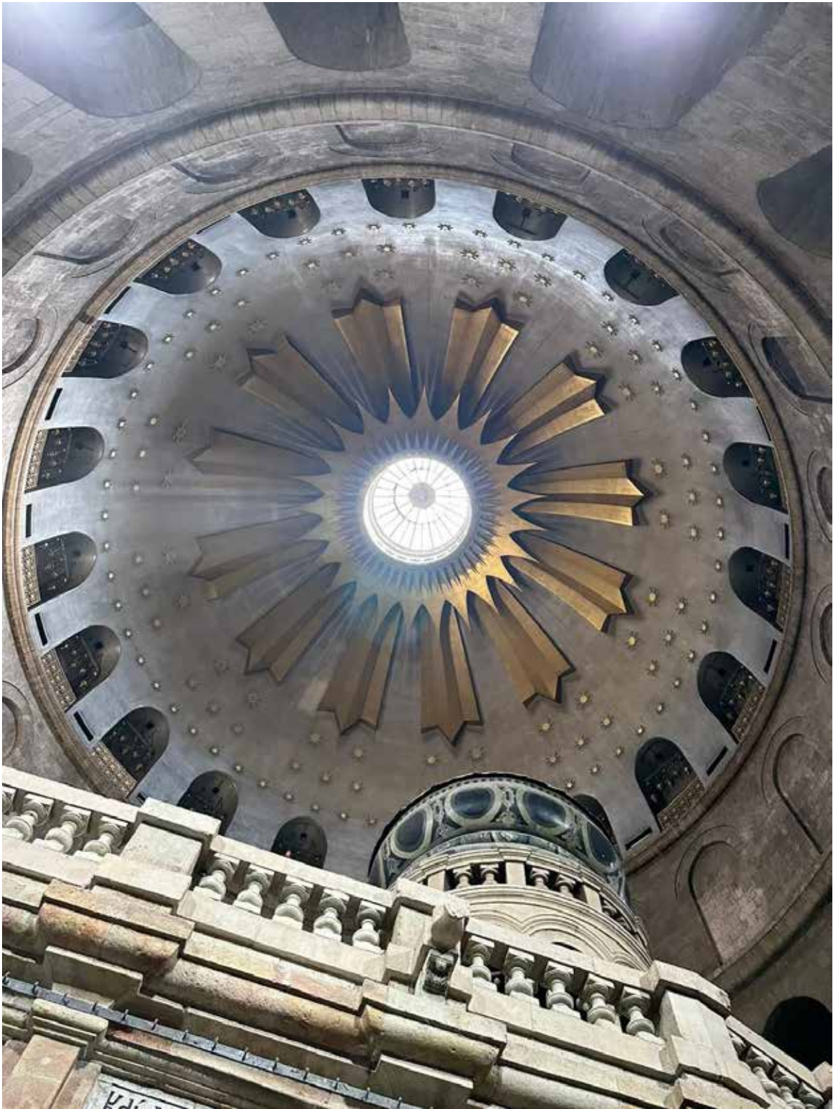
Inside the Church of the Holy Sepulchre, a place of Christian pilgrimage since the 4th century.