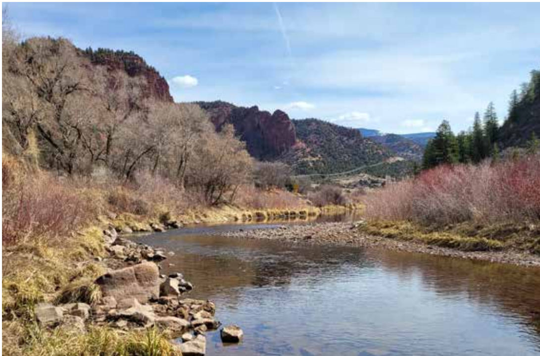
The Frying Pan River near my Colorado home

This is a simple story of understanding. Understanding that none of us truly know what is going on in other people’s lives. And maybe, occasionally, we should remember that grace should be our first reaction.