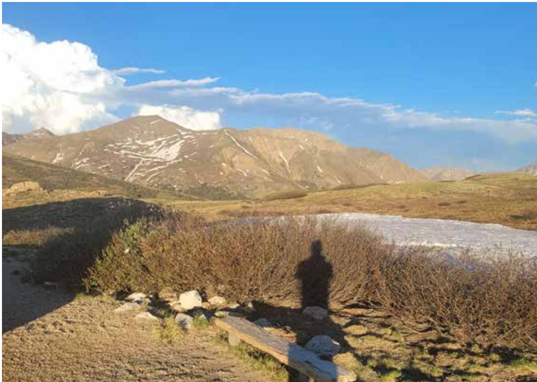
Independence Pass, Continental Divide

As We Anticipate New Broadband Maps, Let's Look at the Largest Broadband Providers in America